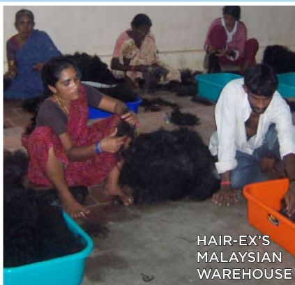
HAIR-EX'S MALAYSIAN WAREHOUSE